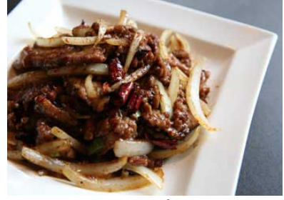
🔥 Cumin Beef