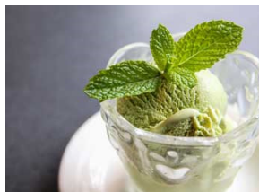
Green Tea Ice Cream