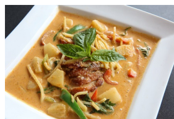
Pineapple Curry Duck