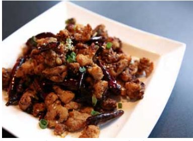
🔥 Chongqing Spicy Chicken