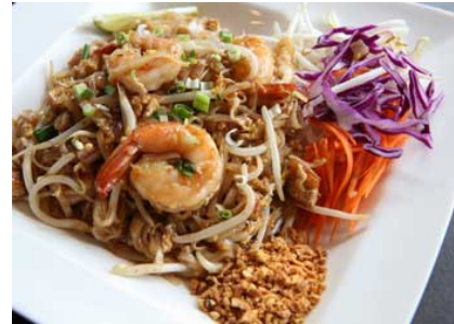
Noodles: Phad Thai with Prawns