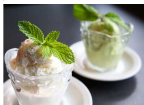
Coconut Ice Cream