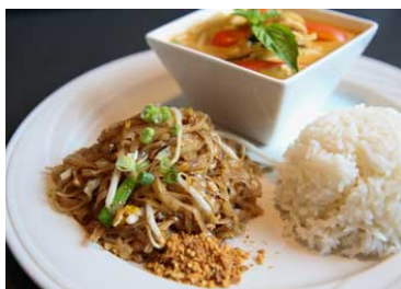
🔥 Curry Chicken, choice of Curry with Phad Thai