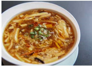
🔥 Hot & Sour Soup