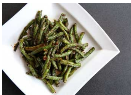
🔥 Sautéed String Beans