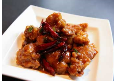
🔥 General Tso's Chicken