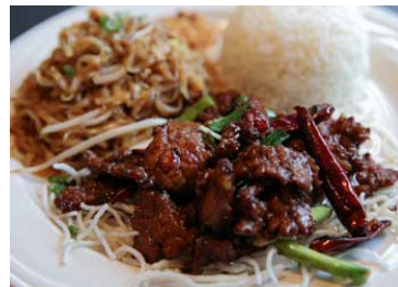
🔥 Mongolian Beef with Phad Thai