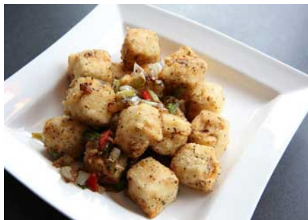
Salt & Pepper Crispy Tofu